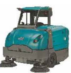
Ride on Sweeper