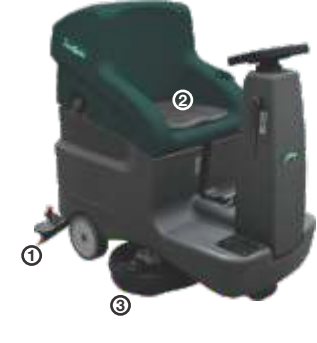
3. Autostop mechanism brush gets activated when machine is idle