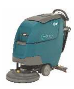
Walk behind Scrubber