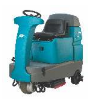
Ride on Scrubber